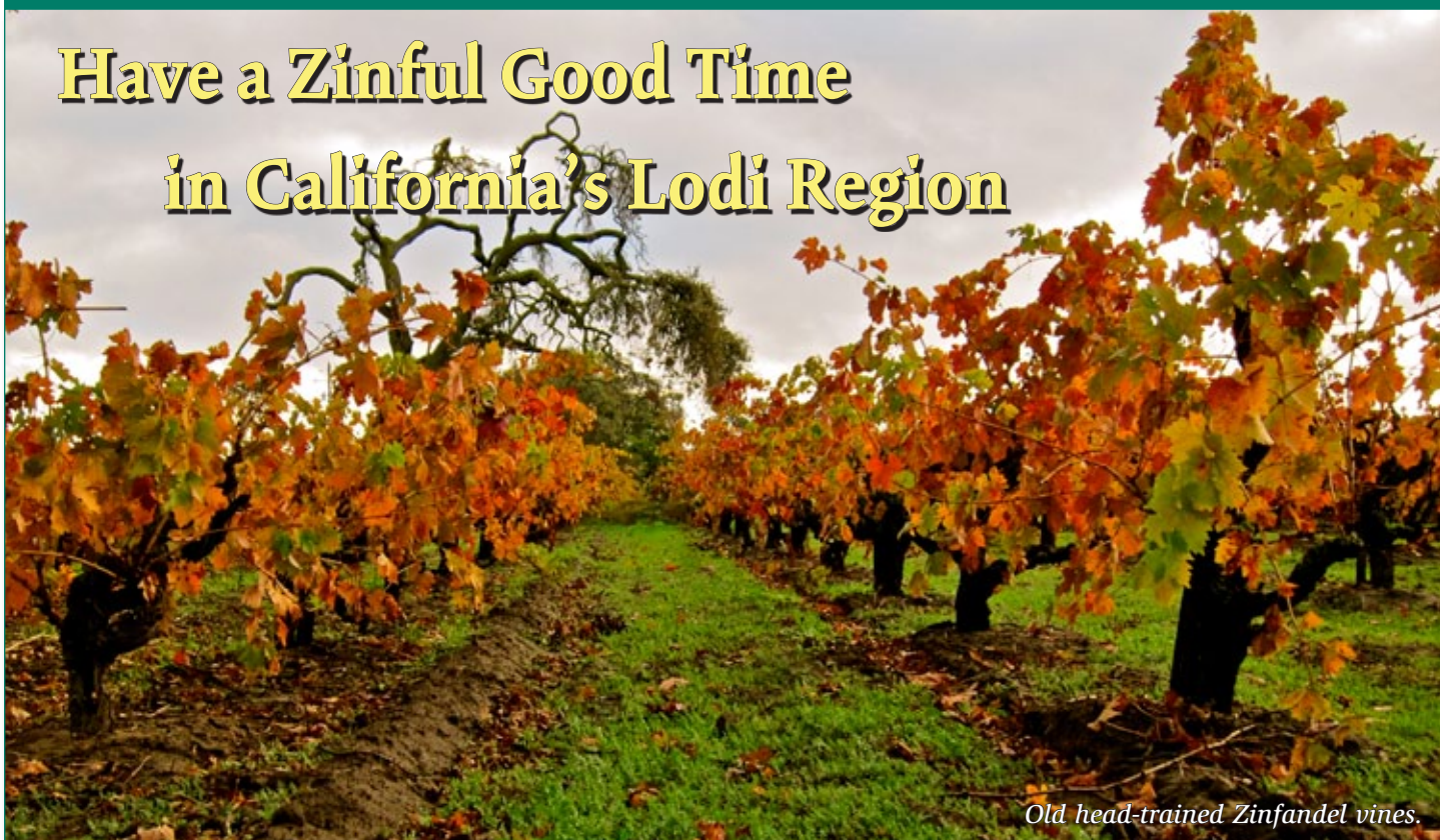
Old head-trained Zinfandel vines.

L ocated between San Francisco and the Sierra Nevada mountains, Lodi wine country makes a great day trip — or a destination in its own right.