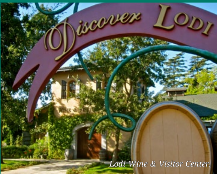
Lodi Wine & Visitor Center.

It's home to all of California's leading varieties, and has long been the leading producer and California's best-kept secret for Cabernet Sauvignon, Chardonnay, Merlot, Sauvignon Blanc and Zinfandel.