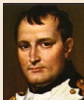
— Napoleon Bonaparte

“In victory, you deserve Champagne. In defeat, you need it.”